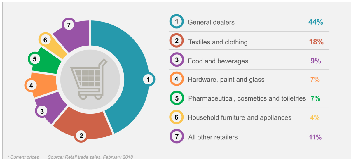
Figure 1: Percentage of total retail trade sales by type of retailer

trade in non-specialised stores”, with textiles and clothing making up the second largest category at 18% as shown in the figure below.